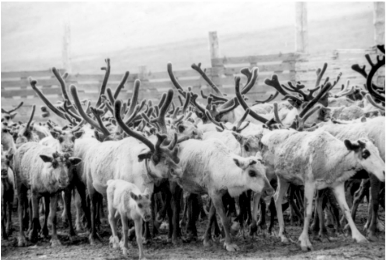
Reindeer in the Davis corral during summer handling.