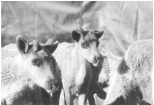
Reindeer calves in July.

used to estimate survival rates. The model was calibrated using reindeer herd records from 1984–1997. Output includes changes in herd size and composition over a thirty-year period, meat production, antler production, female: male ratio, and predicted net income. The model illustrates the sensitivity of herd size to female adult survival rates.