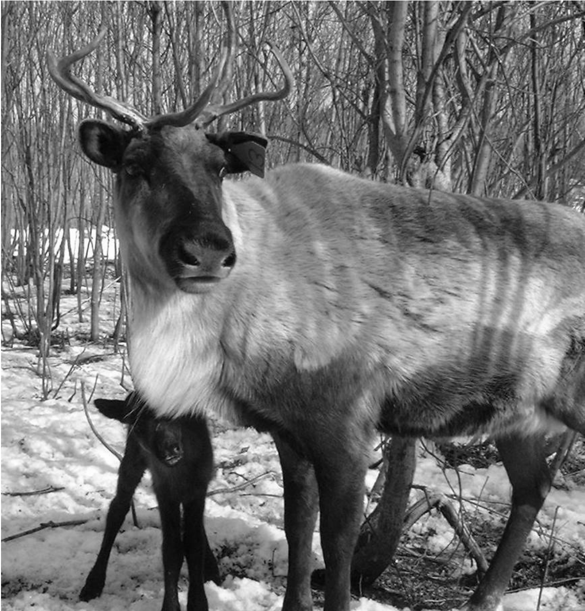
FIGURE 2 Reindeer cow with newborn calf.